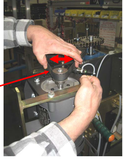
11. Rehook spring up to the dancer bar. (See illustration with step #1)